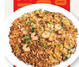
Shrimp Fried Rice