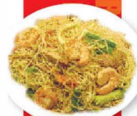
Singapore Rice Noodle