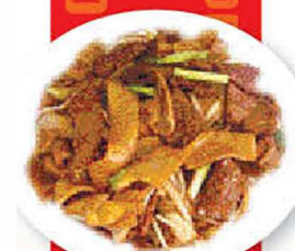
Beef Chow Fun