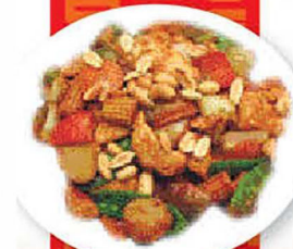
Kung Pao Chicken